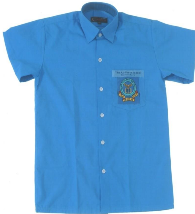
SHIRT FOR CLASS VI-XII LOGO (7.5 CM X 7 CM) FOR MIDDLE CLASSES LOGO (9 CM X 7.5 CM) FOR SEC & SR SEC CLASSES