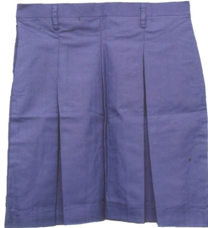
SKIRT FOR CLASS i-VIII

LOGO 7.5 CM X 7 CM FOR MIDDLE CLASSES VI TO VIII