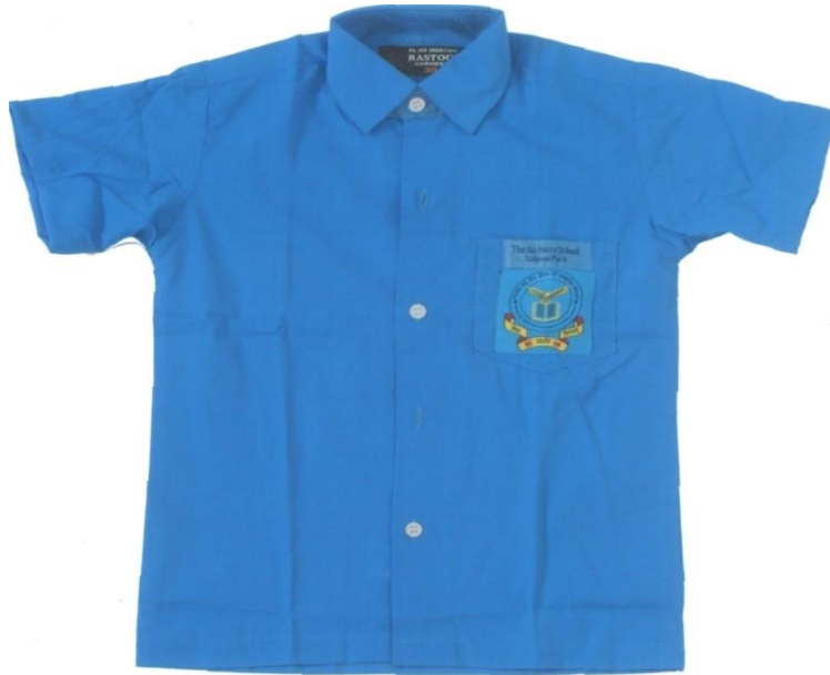
SHIRT FOR CLASS I-VIII

LOGO (7 CM X 6 CM) FOR PRE- PRIMARY 1st PRIMARY CLASS ES (LKG TO V)