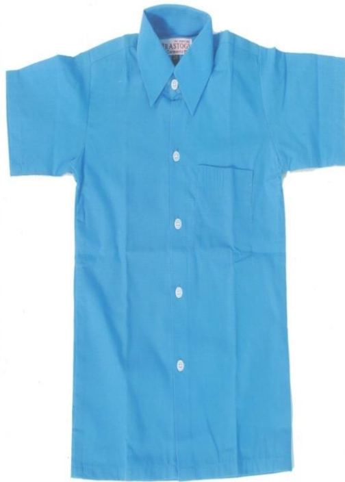
SHIRT FOR LKG/UKG