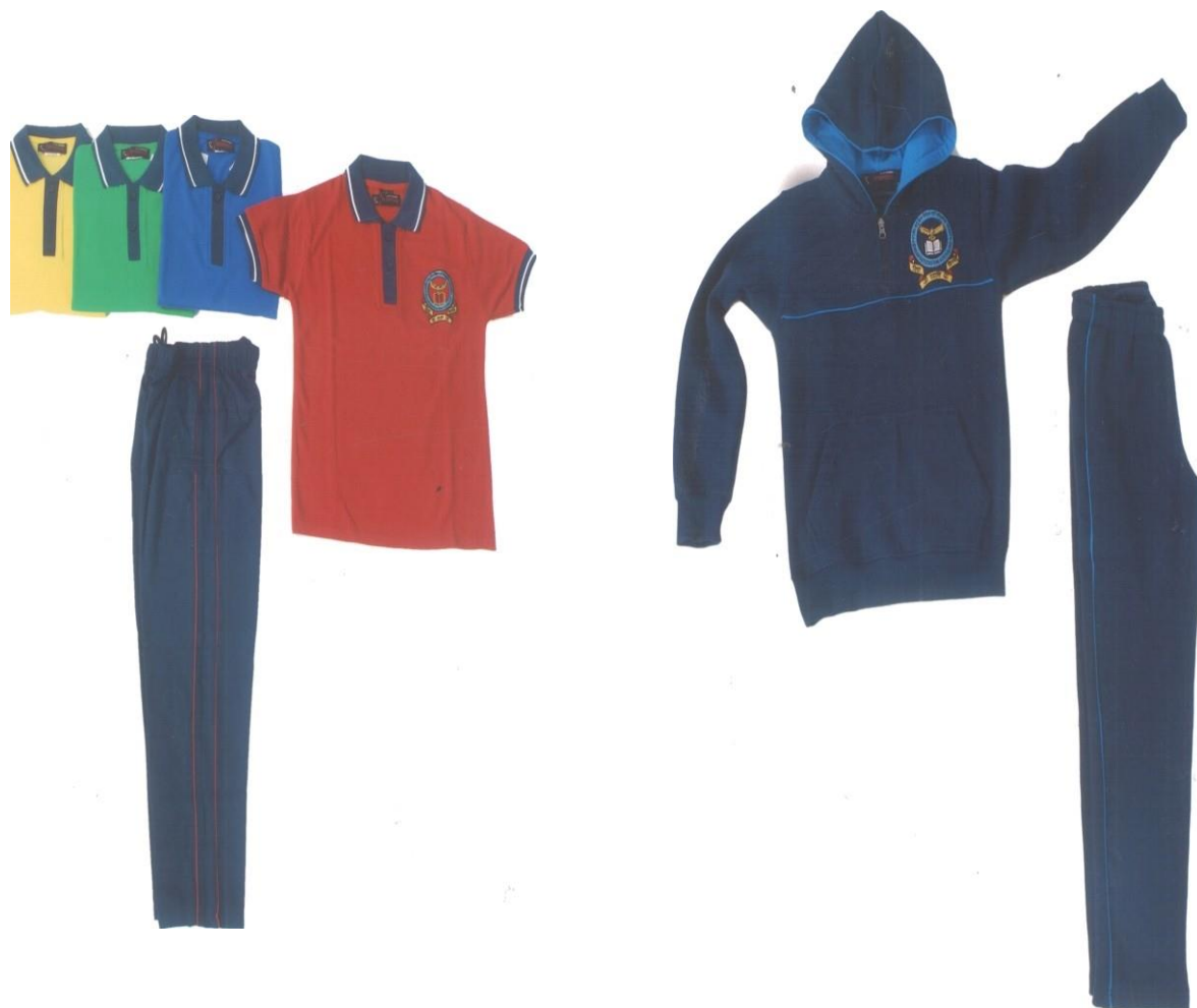
T SHIRT WITH TRACK PANT