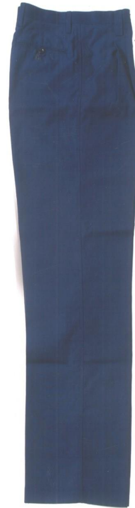
TROUSERS FOR CLASS VI-XII