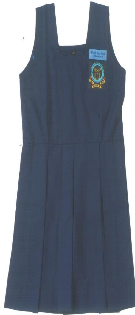
TUNIC FOR LKG/UKG [ LOGO (7 CM X 6 CM) ]