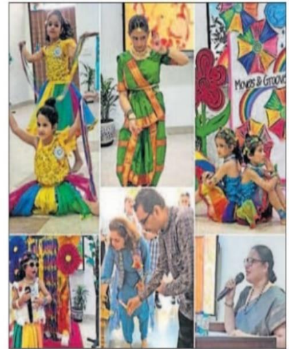
The festival of arts featured an interesting array of inter-school competitions for the participants

Scan the code for all the latest updates