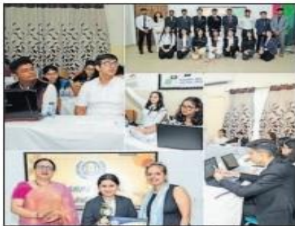
Marked by meaningful debates and the passing of impactful resolutions, the event was a big success

American Montessori Public School, Sector 25, Gurgaon, hosted its 5th Model United Nations (MUN) conference, bringing together 150 delegates from 13 esteemed schools from Delhi-NCR. Marked by meaningful debates, discussions and the passing of impactful resolutions, the event was a resounding success.