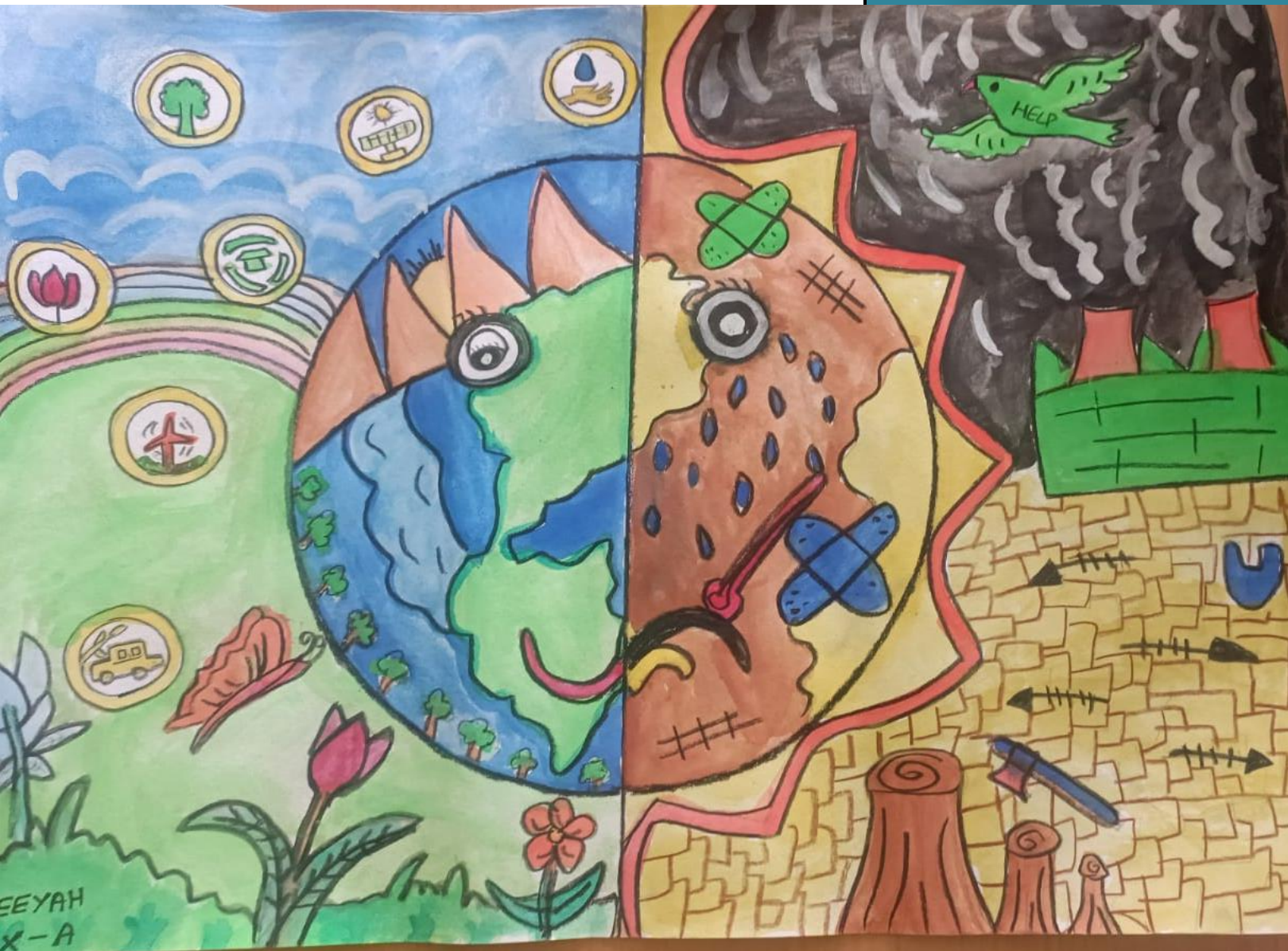
PAINTING BY- REEYAH - X A