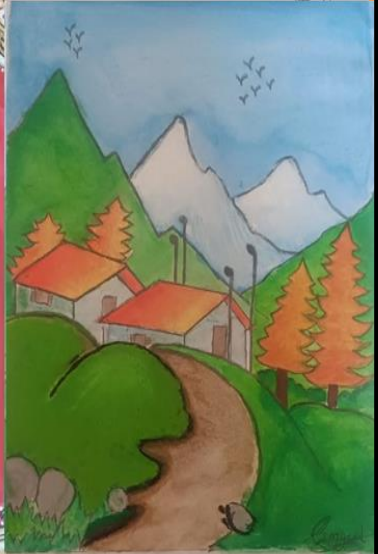
class VII - A