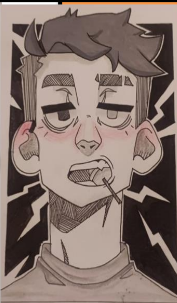
Vanshika VII - A