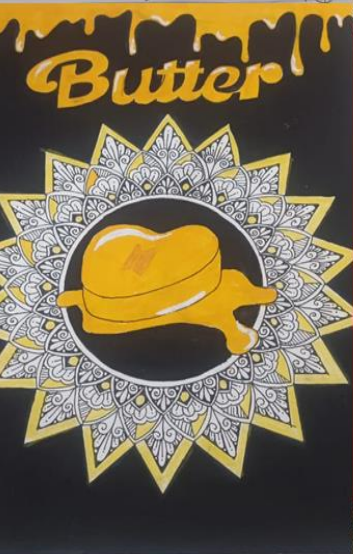
Vanshika Sehraw VII - A