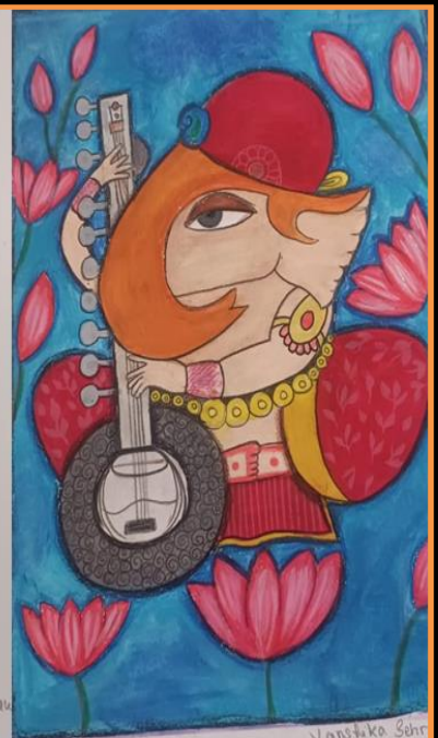
Vanshika Sehraw VII - A