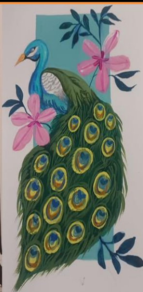
Vanshika Sehraw VII - A