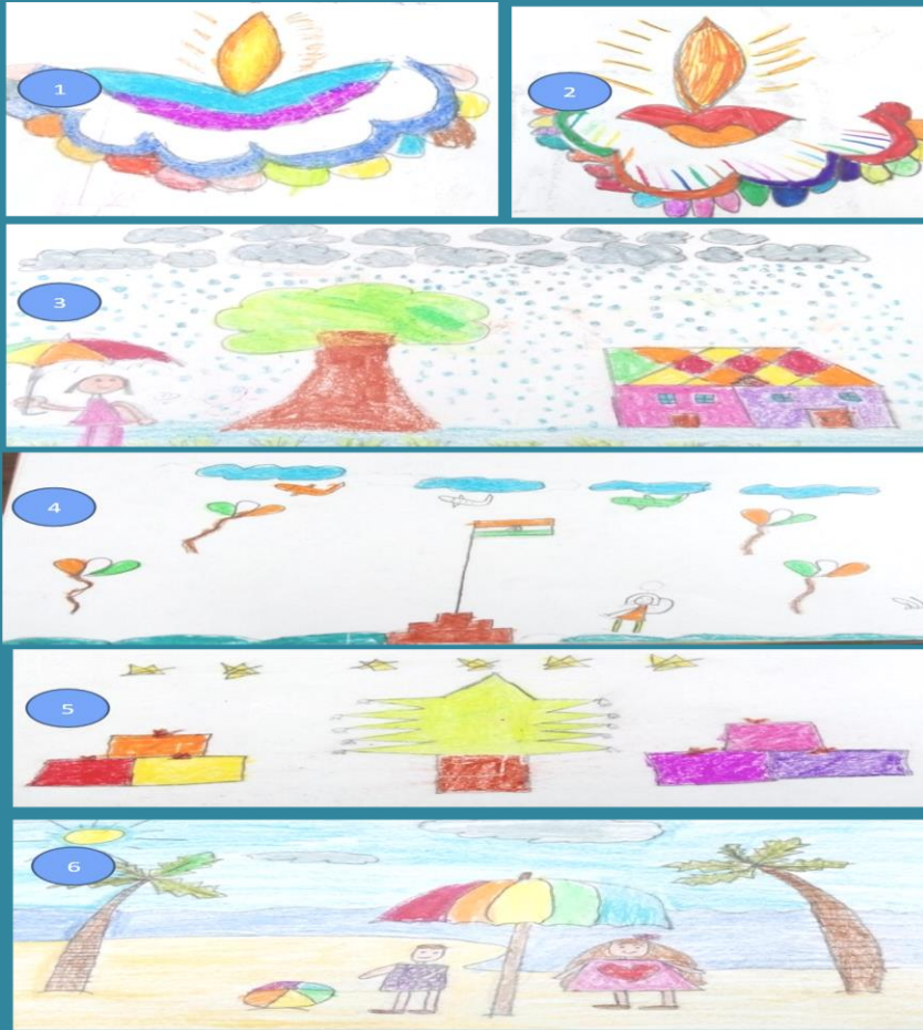
Drawings by- Picture 1-Mayra 2-Larisha, 3- Jigyaa 4- Naira 5- Lavneet 6-Goornoor