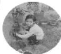
GREEN BIRTHDAY PROJECT