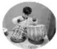
MAESTRO IN MAKING