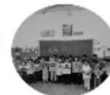
DROP EVERYTHING AND READ