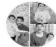
LIFE SKILL AND VALUE EDUCATION