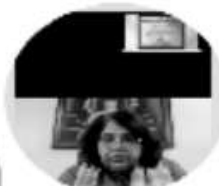
AAO SAPNE DEKHEN