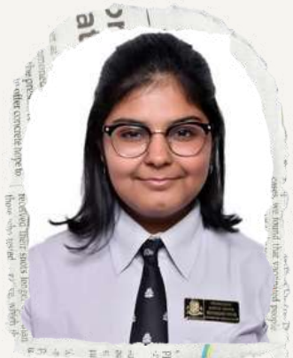
Poem: वीर का विराम Veerangana Sinha X Confucius