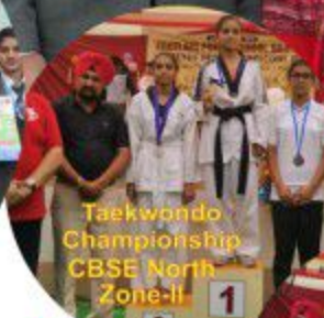
Taekwondo Championship CBSE North Zone-II