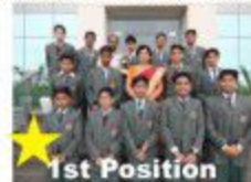
★ 1st Position

District Khelmahakumbh Football Tournament-2017