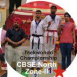
Taekwondo Championship CBSE North Zone-II