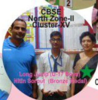
CBSE North Zone-II Cluster-XV