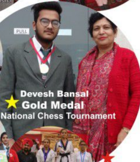
★ Devesh Bansal Gold Medal National Chess Tournament