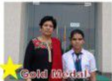
★ Gold Medal

District Khelmahakumbh Shooting Tournament, Palwal