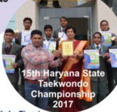
15th Haryana State Taekwondo Championship 2017